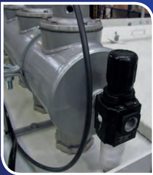
Norgren air filter and regulator