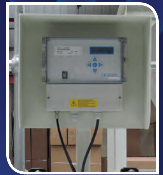
Digital pulse sequence controller with backlit screen