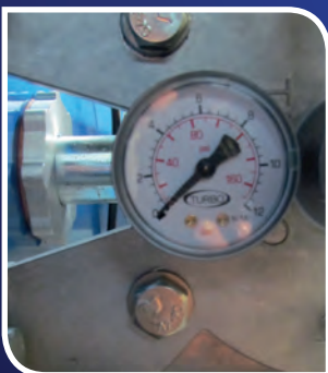
Compressed air gauge