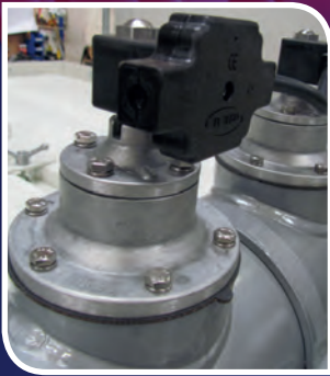
Integrated diaphragm and solenoids with matrix wiring system