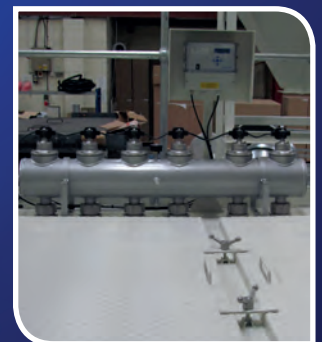
Ease of maintenance - filter bags and cleaning equipment all accessible from the top of the unit