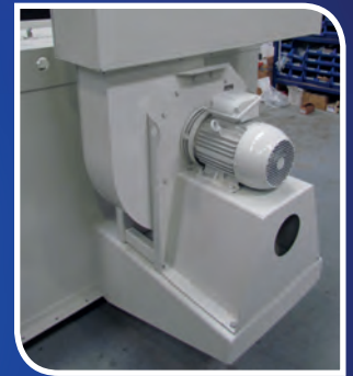
Integral fan set option