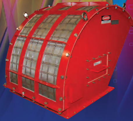
Flameless venting/ suppression

Options such as flameless explosion venting and full suppression systems are available.