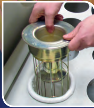
Filter removal through the clean air chamber