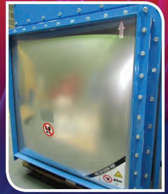
Explosive relief panel