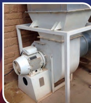
Remote fan set option