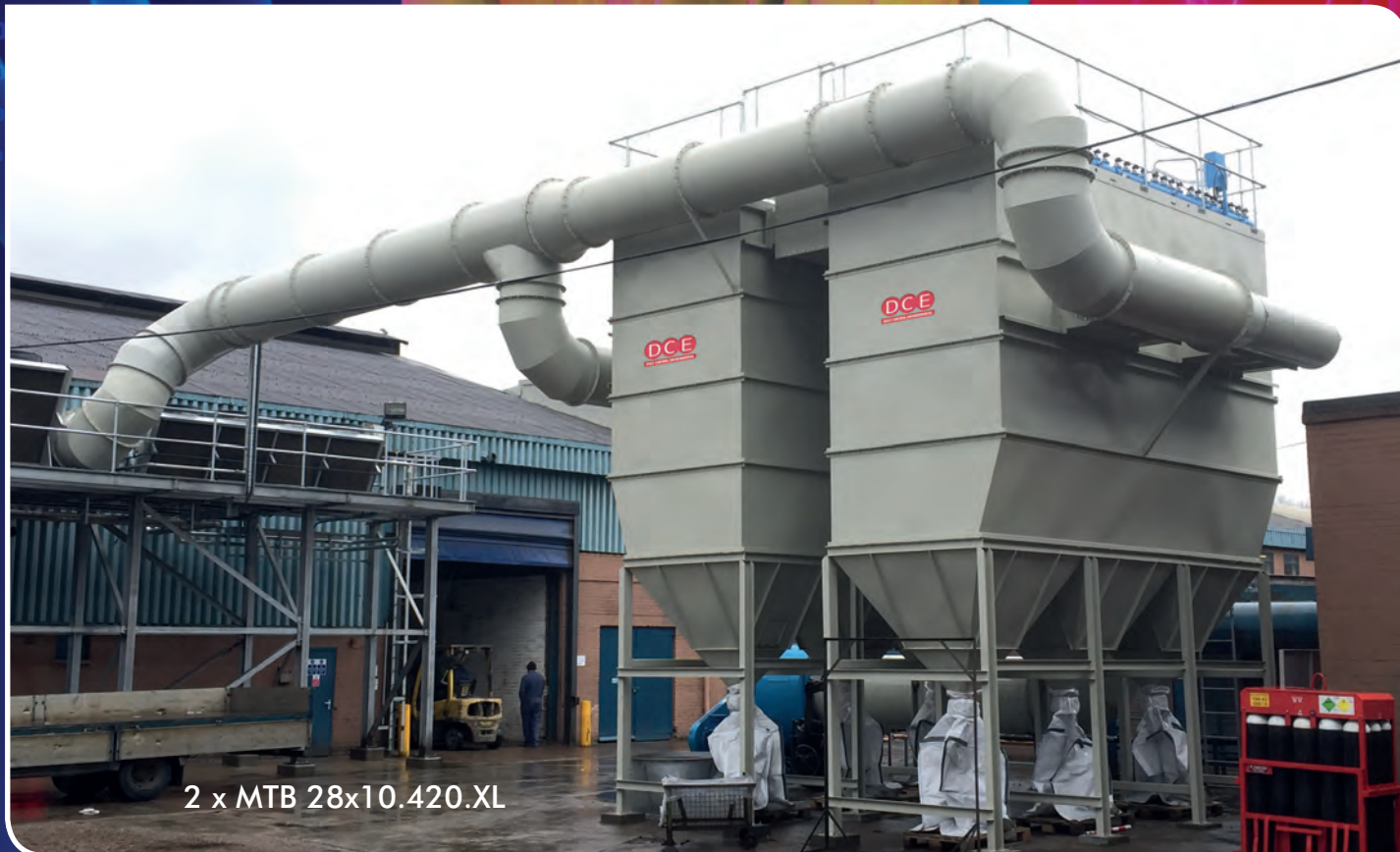
2 x MTB 28x10.420.XL