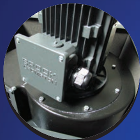
Fan & Silencer